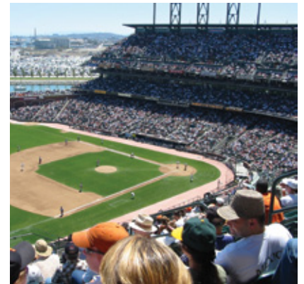
ProRAE Guardian is ideal for threat monitoring and detection of large-scale public venues