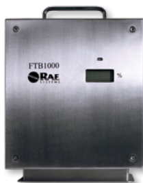
RAE PowerPak External Battery